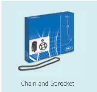
Chain and Sprocket