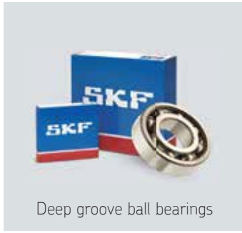
Deep groove ball bearings