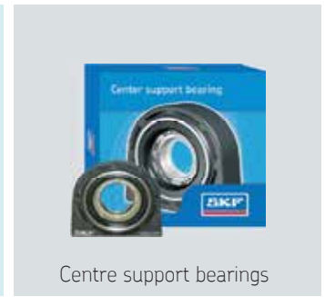
Centre support bearings