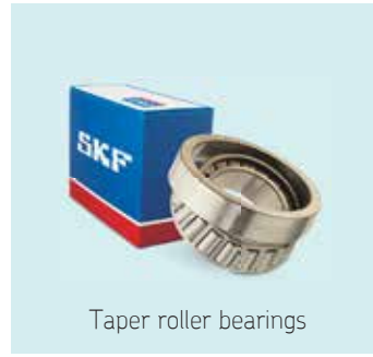
Taper roller bearings