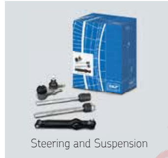
Steering and Suspension