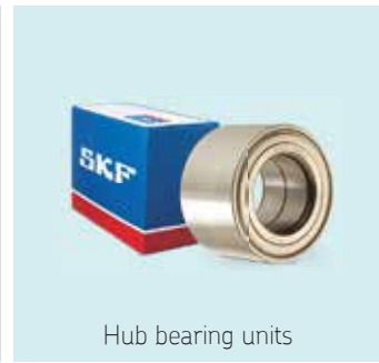
Hub bearing units