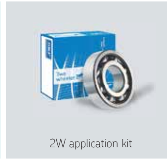
2W application kit