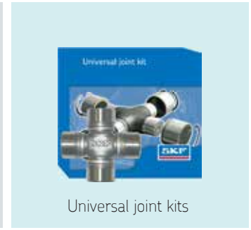
Universal joint kits