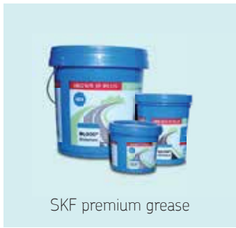
SKF premium grease